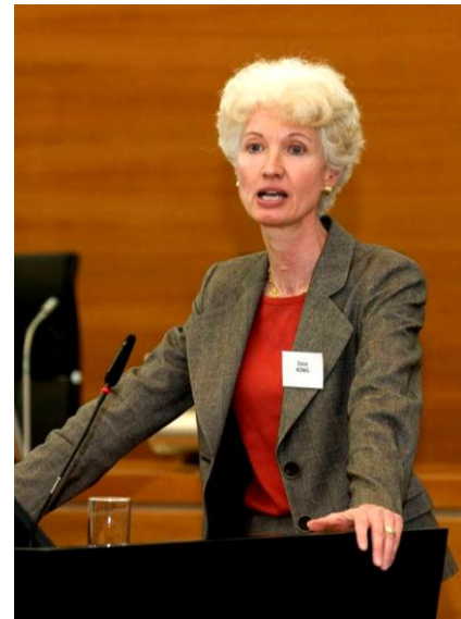
Prof. Dr. Doris König

Today's symposium focuses on fisheries. This is a subject which is not only debated within expert and diplomatic circles but also in the media. According to the FAO State of the World Fisheries Report 2008, most of the top ten species are fully exploited or overexploited. The areas showing the highest proportion of fully exploited stocks are the Northeast Atlantic, the Western Indian Ocean and the Northwest Pacific. Overall, 80 percent of the world fish stocks for which assessment information is available are reported as fully exploited and, thus, requiring effective and precautionary management. Fish and fishery products are highly traded, and prices are increasing. That puts ever more pressure on fish stocks. Another key fisheries management issue is the lack of progress with the reduction of fishing capacities and related harmful subsidies. High prices and excess capacities are the root causes of illegal, unreported and unregulated (IUU) fishing.