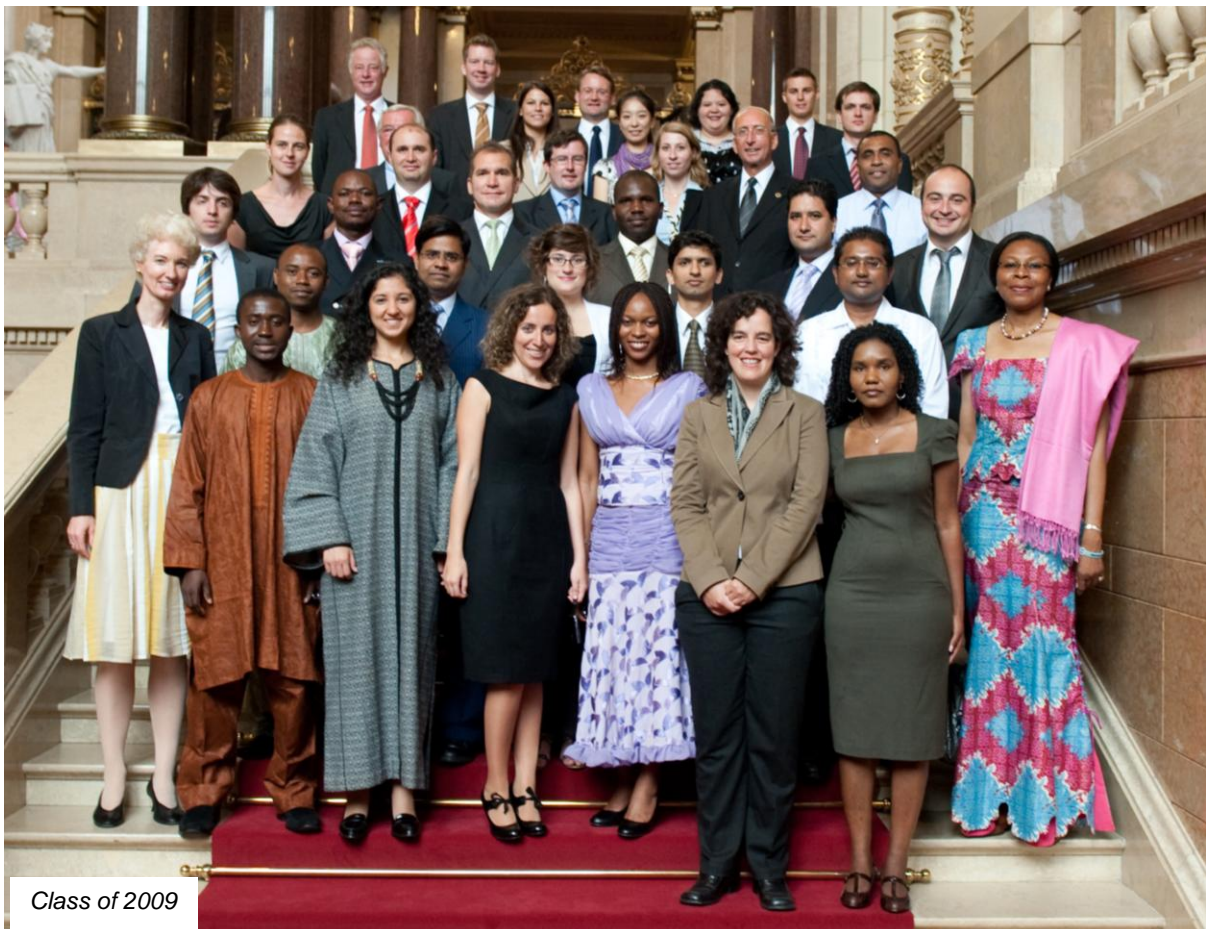
Class of 2009

The Press was with us for interviews and coverage of the Delimitation Workshop as well as during the "Baltic Experience" – our classic excursion to Lübeck and to the beaches.