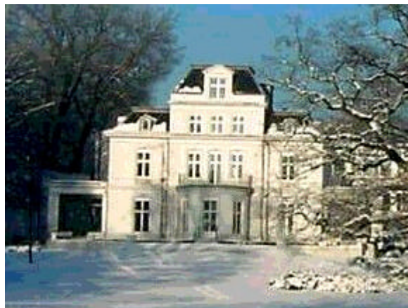
Winter in the Park